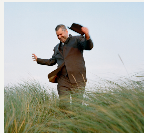
Daniel Handler