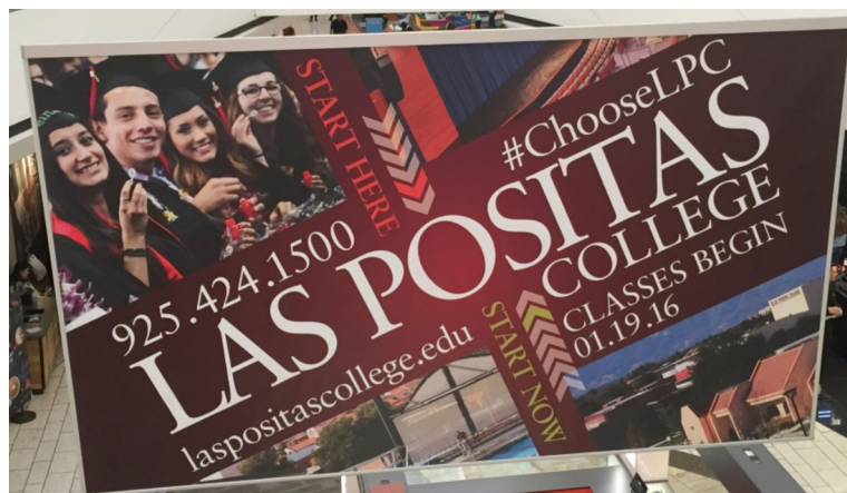
LPC's banner in Stoneridge Mall during the holiday season

Spring 2016 is shaping up to be one of the biggest semesters on record for LPC. We have more classes, more faculty, and more options for students in our spring 2016 Schedule of Classes. Also, we are able to offer more opportunities through our "Gateway to STEM Program," sponsored by a $2.3 million grant from the U.S. Department of Education. LPC is providing new and enriched programs for all students, but specifically targeting Hispanic students. Students can still register for classes, which begin January 19th.