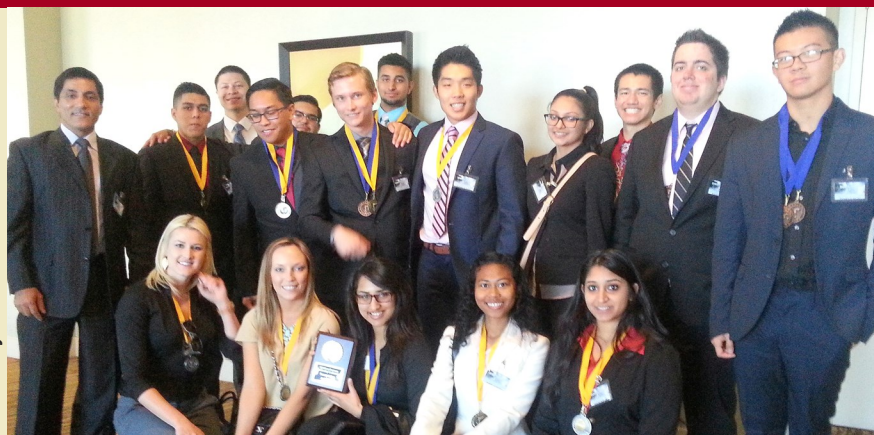
LPC students celebrate their conference win over students from UC Berkeley, UCLA, UC San Diego, UC Davis, USC, and more.

LPC students meant business at last month's California Phi Beta Lambda State Business Leadership Conference in Los Angeles where they placed second in the state, competing with 280 students from 16