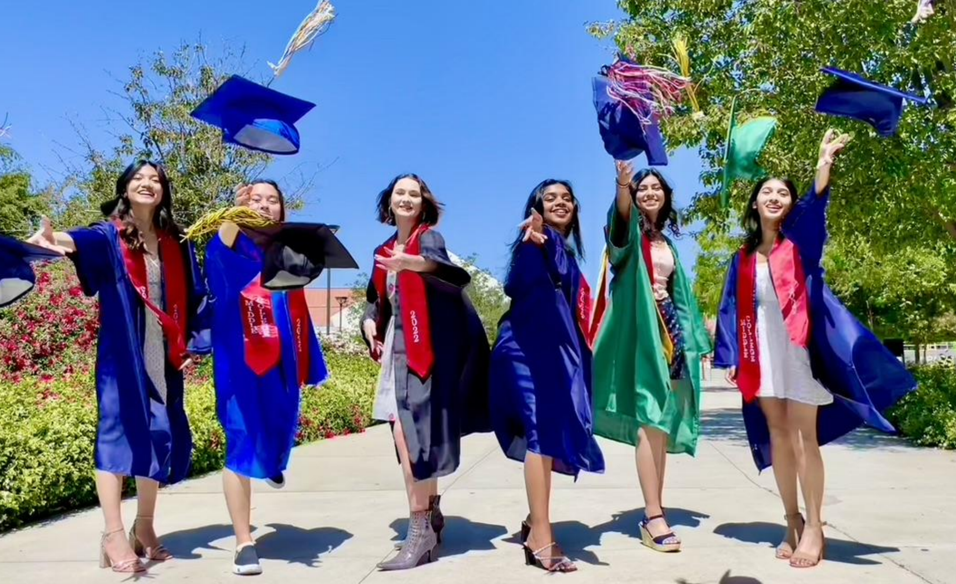
The TVROP Middle College High School program at LPC is an alternative educational program that provides high school students the opportunity to complete their last two years of high school at Las Positas College, earning high school and college credit simultaneously.