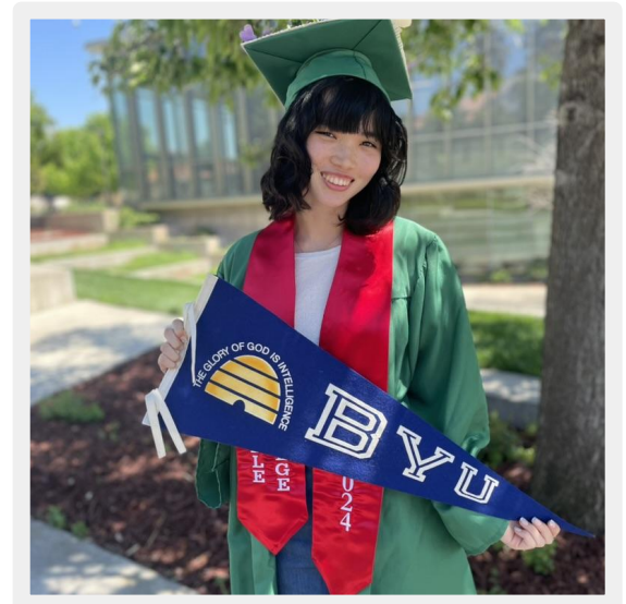
Private, Out of State, & Other Programs 10