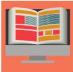
Online Material Access