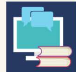
Online Course Support