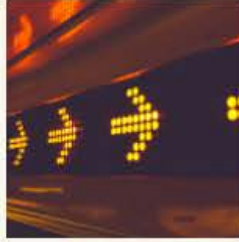
Check Out Items