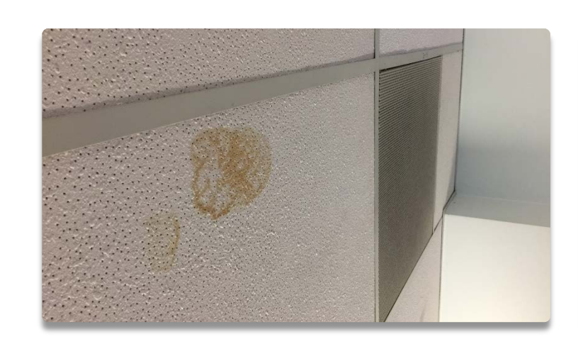
New Ceiling Tiles in offices