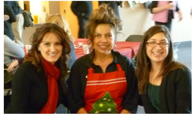
Sponsored by our LPC Administrators