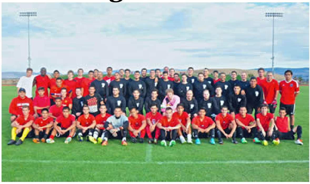
LPC Men's Soccer Team 2014 Coast Conference North Division Winners