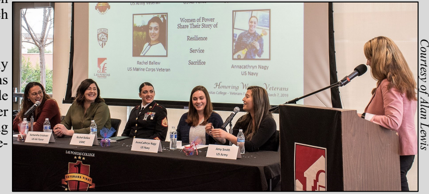
Q & A Panel Discussion Participants.

The LPC Veterans First Program is primarily responsible for the administration of veterans educational benefits programs. They provide other resources and contacts, such as career planning, financial aid, transition counseling services, and other needed services for our returning Veterans.