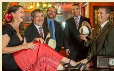
Cascada de Flores

Cascada de Flores | 7 p.m., September 14, Mertes Center