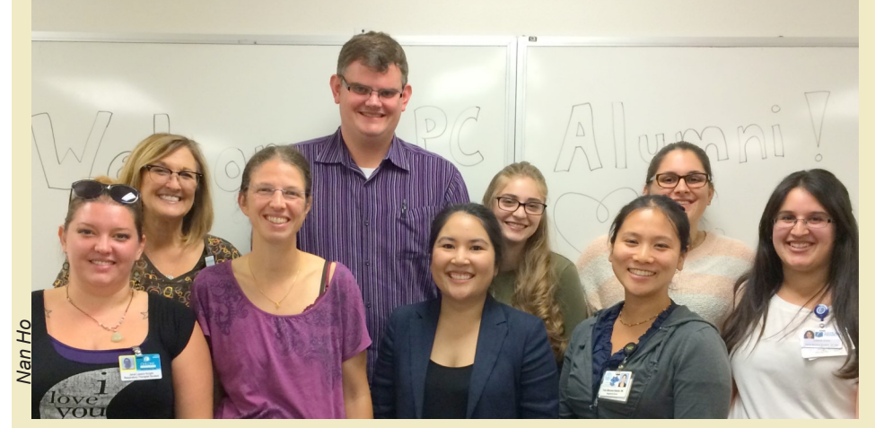
Thanks to the nine LPC alumni who presented on the Health Science Alumni Panel. Students appreciated the tips and advice on how to succeed in the next step of their education and careers.

Nine alumni returned to LPC on October 22nd to present a Health Science Alumni Panel to a capacity audience of LPC students. The alumni are enrolled in health science programs or practicing in fields including nursing, respiratory therapy, pharmacy, and occupational therapy. Alumni talked about their experience and shared advice about many topics including patient care and transferring from a community college into Allied Health programs and how to prepare and strengthen applications to the programs. The panel was sponsored by the LPC Biology Department and Biology Club.