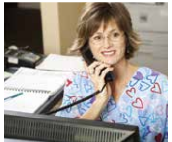
Allied Health p. 6