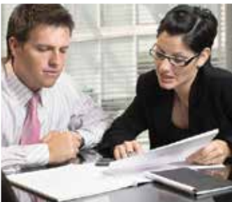
Power BI p. 8