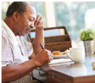
Writing p. 14