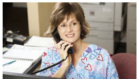
More Allied Health classes and Certificates available at the website.

MBS634 9/7 Sat 10:00-11:00am $25 and 10/17 Thu 6:30-8:30pm Materials Fee $29