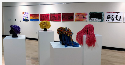
February 6, Art Showcase and Presentation by Dr. Claude Steele, "Stereotype Threat and Identity Threat"