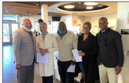
February 3, Signing of, "Lift Every Voice and Sing," (also known as the Black National Anthem).

The LPC Black Student Union and Watemi (the LPC Council of Elders for Black and Brown Students) presented LPC's Black History month celebrations. The group of students, faculty and staff curated a month of events that included art exhibits, film, panel discussions, and presentations.