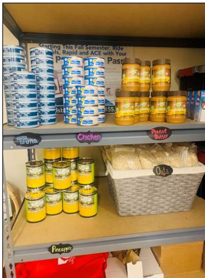
The Mini-Market inside the Student Life Office